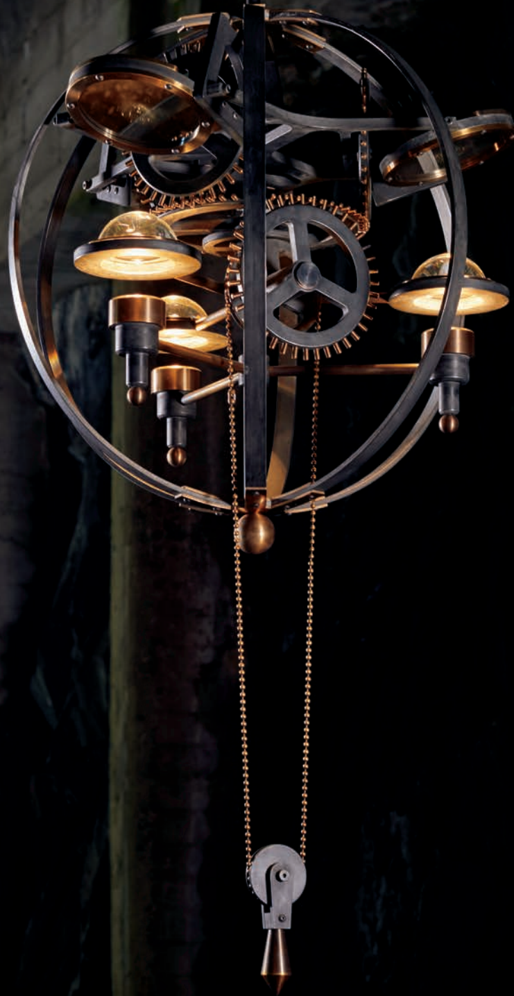
Leonardo 1482 Chandelier