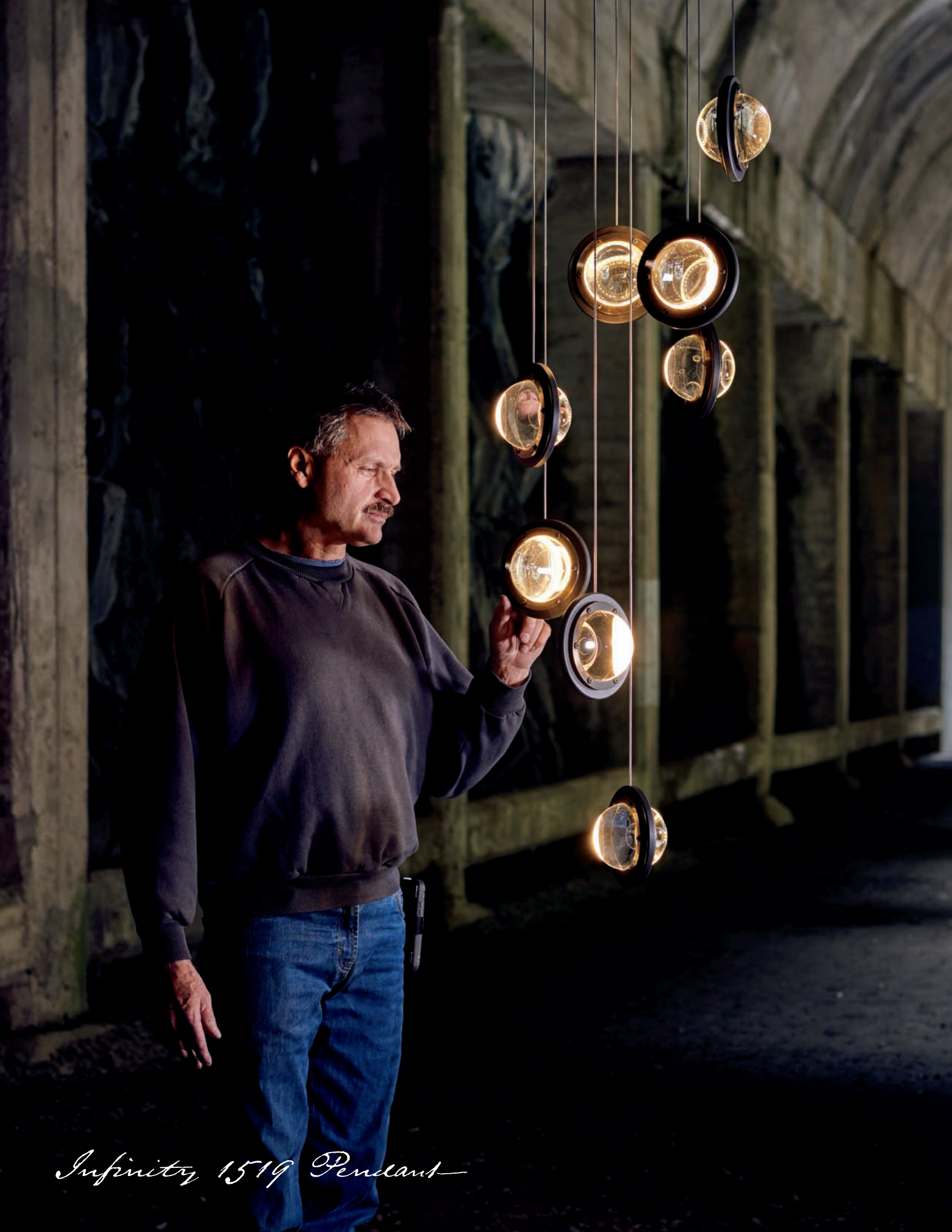
Infinity 1519 Pendant