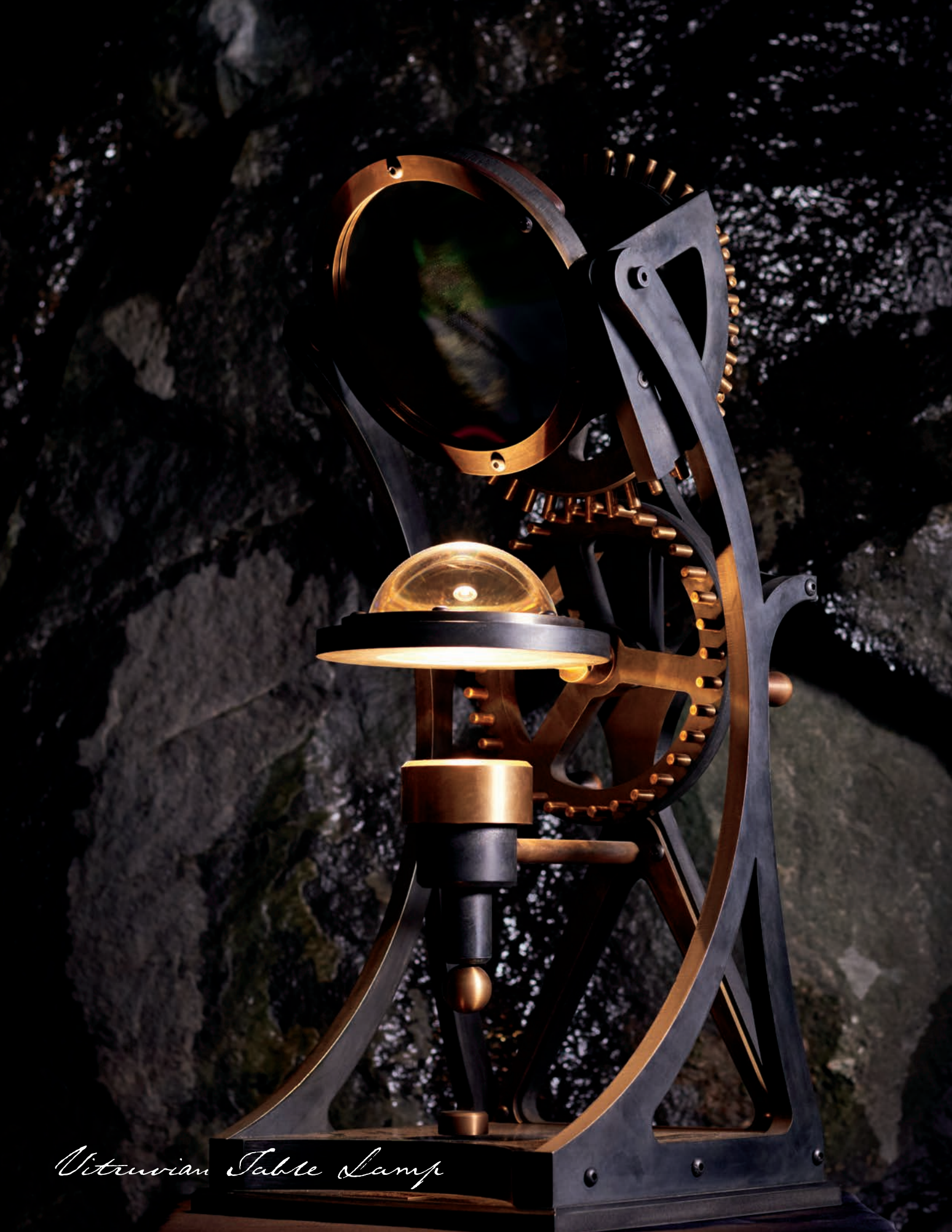
Vitruvian Table Lamp